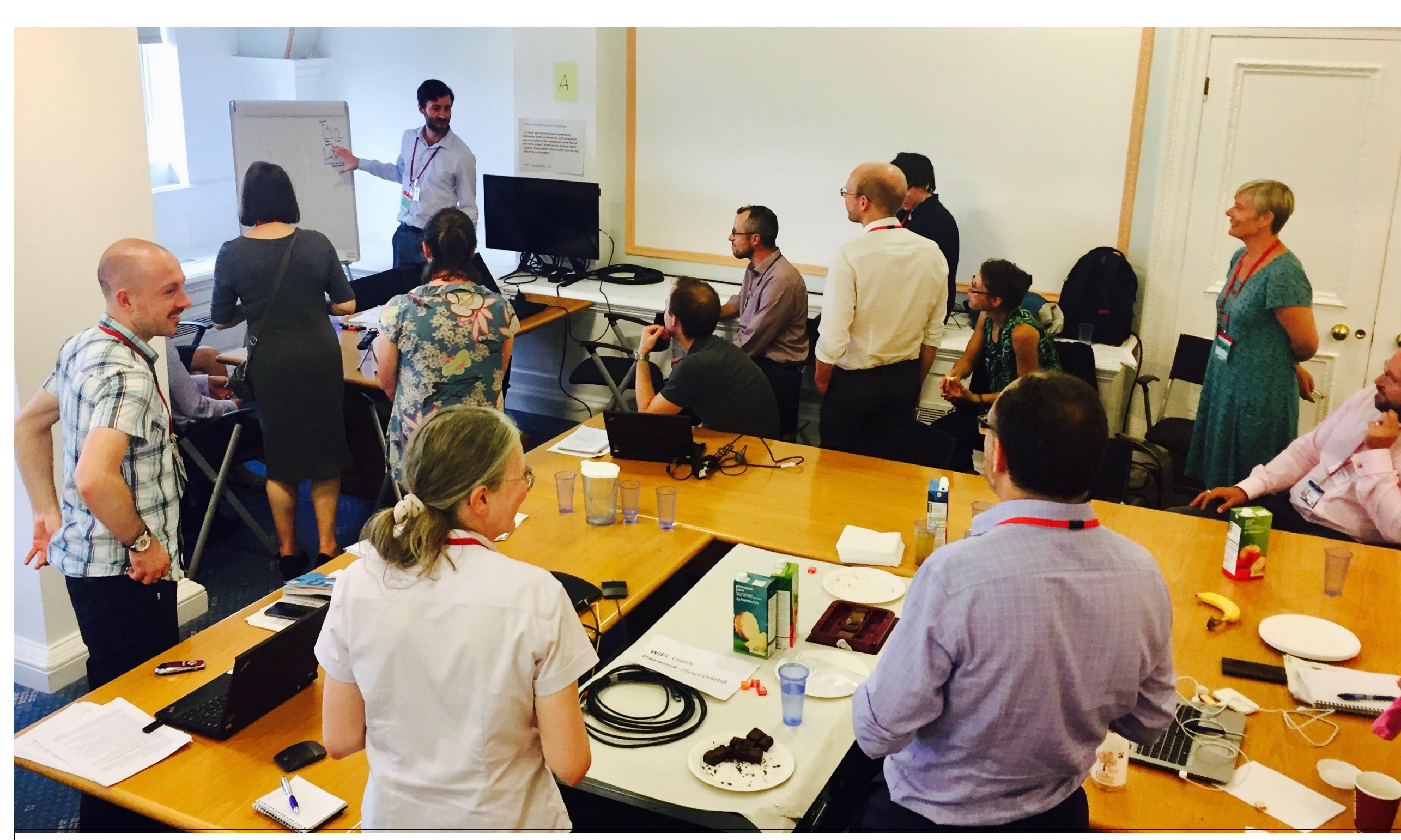
An event with Cecan and Defra to explore new methodologies of evaluation